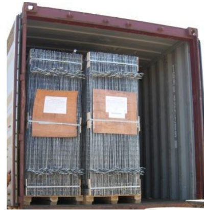
Panels in container

The shipping line will call you directly for a delivery appointment so you can be prepared with equipment and labor. IF you make any special requests of them ASK if there is an added charge for that service.